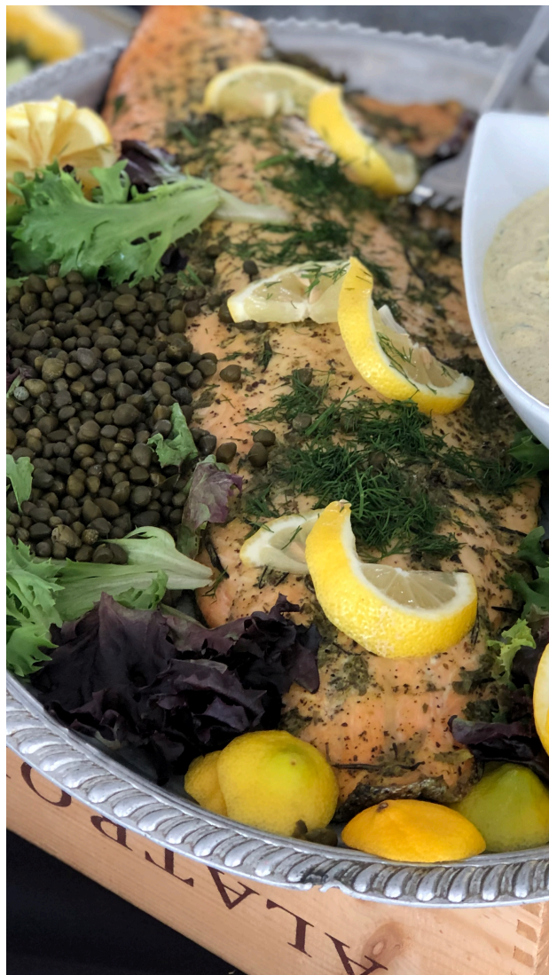
TABLE DISPLAY TRAYS